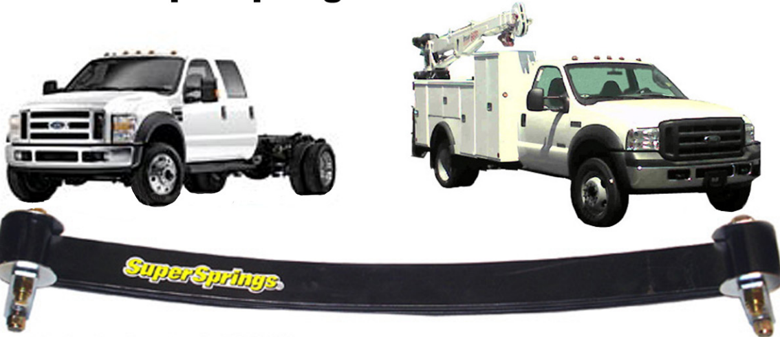
Poly Spring Pad~ PSP-1