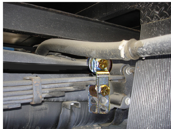
Square shackle to the rear / insure fuel filler line clearance

Refer to SuperSprings application guide for part selection www.supersprings.com [Tech line #866-898-0720] SuperSprings enhance load carrying capability, handling & towing. Never exceed vehicle manufacturer's GVWR rating.