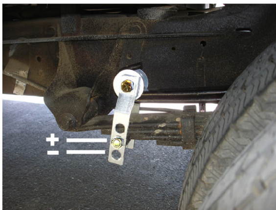
Selectable preload & ride height