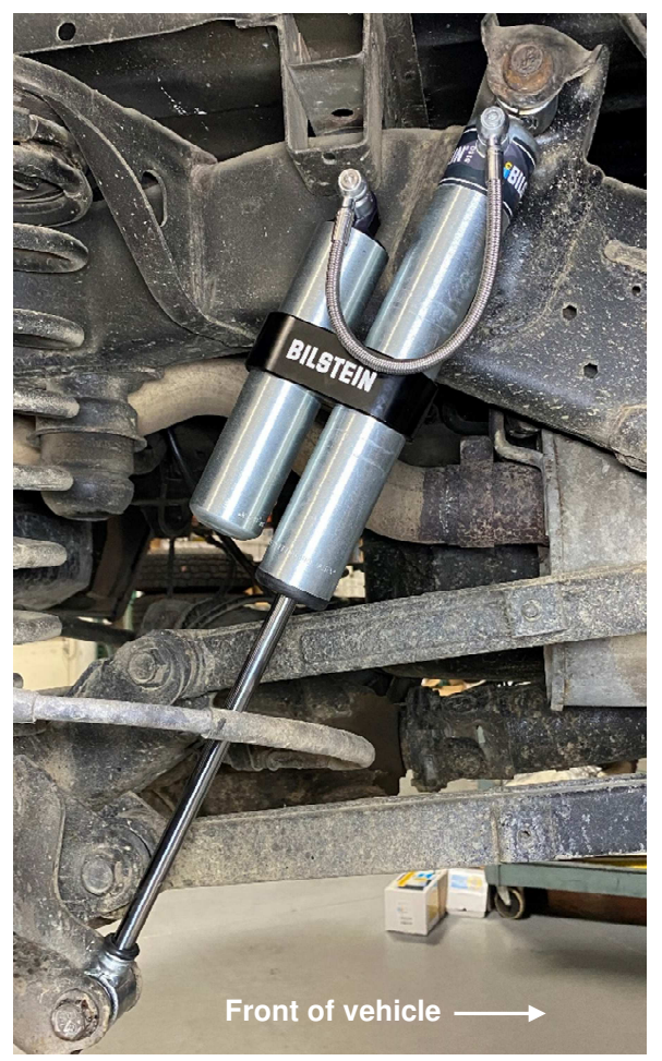
Figure 1. Right (passenger) side E4-WM5-Y738A00 0 page 2 of 3