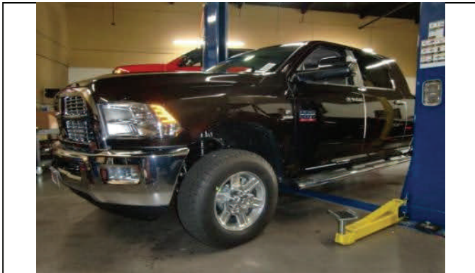
Raise and support front of vehicle on level ground.