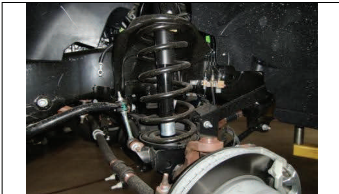
Picture of front suspension. Support front axle with jack.