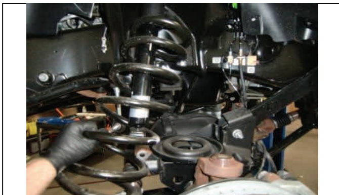
Remove spring towards the front of the vehicle.