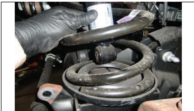
Slowly lower axle in order to remove shock and coil spring.