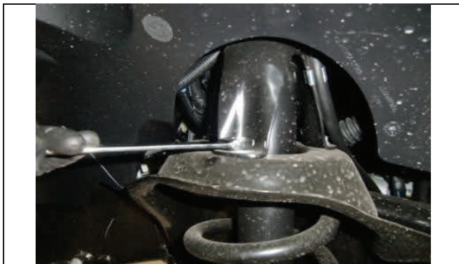
Loosen all (3) upper shock tower mounting nuts. Leave on.