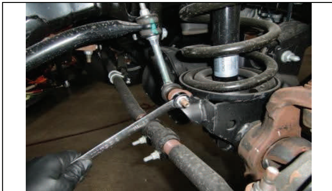
Disconnect pass/dr lower sway bar endlinks.