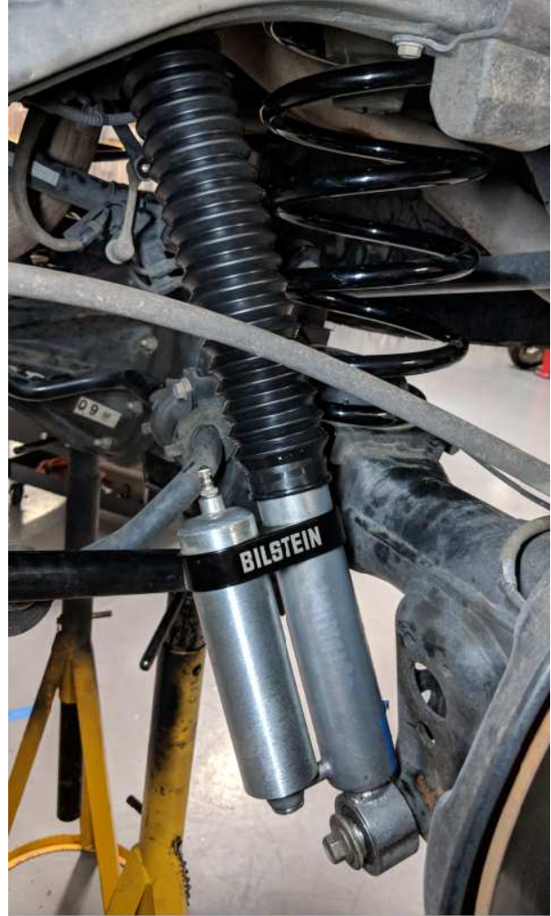
Figure 3 – LEFT REAR

Note: The shocks depicted herein differ slightly in appearance from the supplied components.