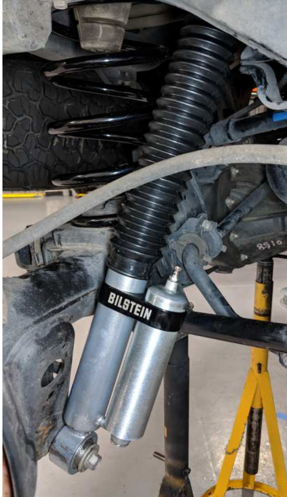
Figure 2 – RIGHT REAR