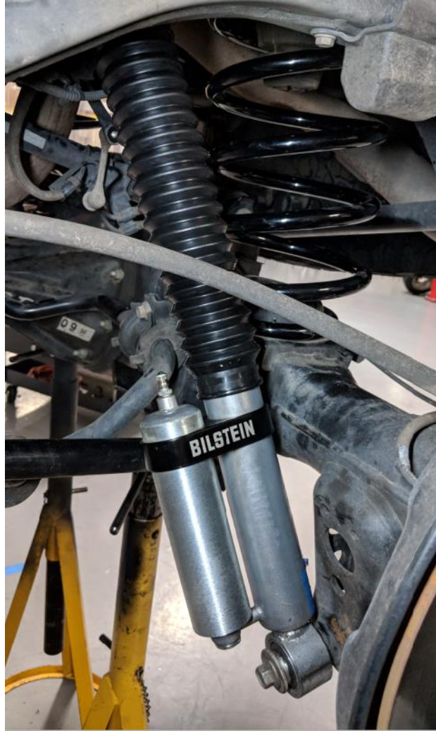
Figure 3 – LEFT REAR

Note: The shocks depicted herein differ slightly in appearance from the supplied components.