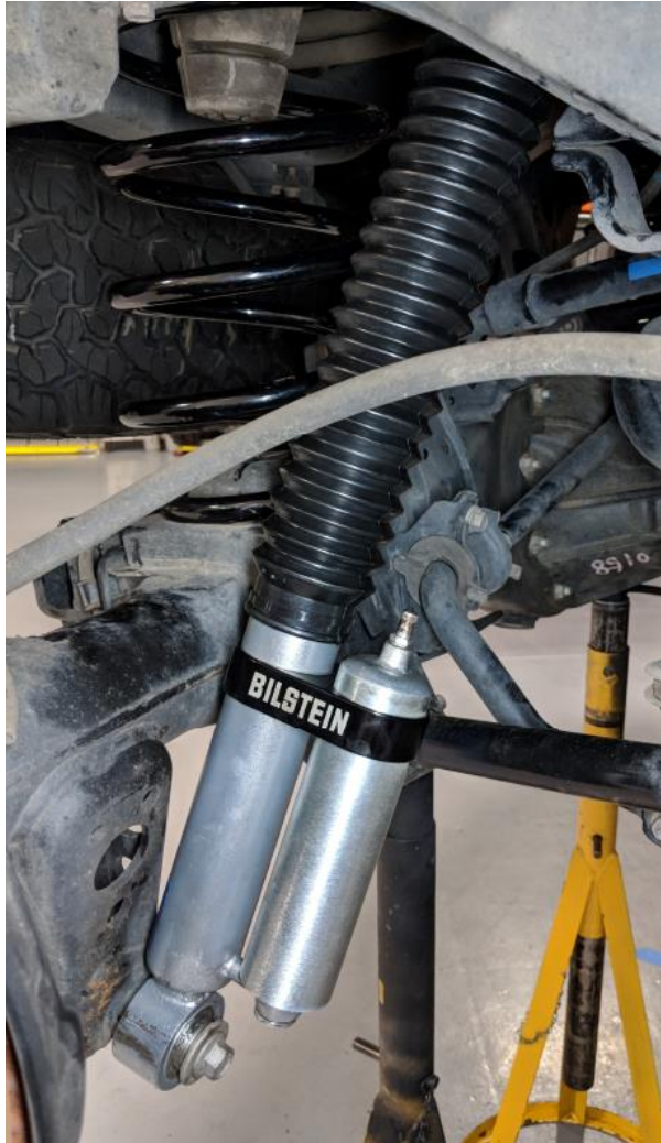
Figure 2 – RIGHT REAR