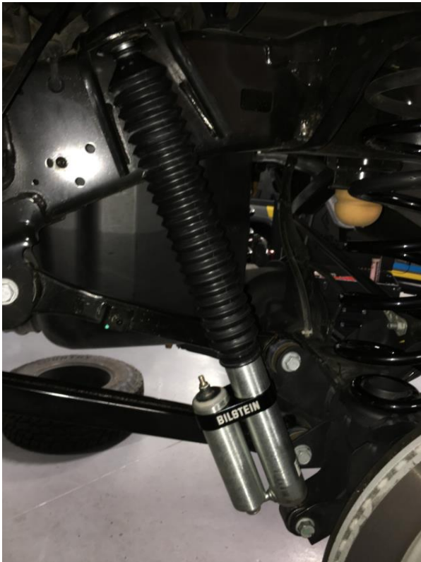
Figure 2 – LEFT REAR