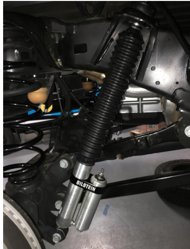
Figure 3 – RIGHT REAR

Note: The shocks differ slightly in appearance from the supplied components.