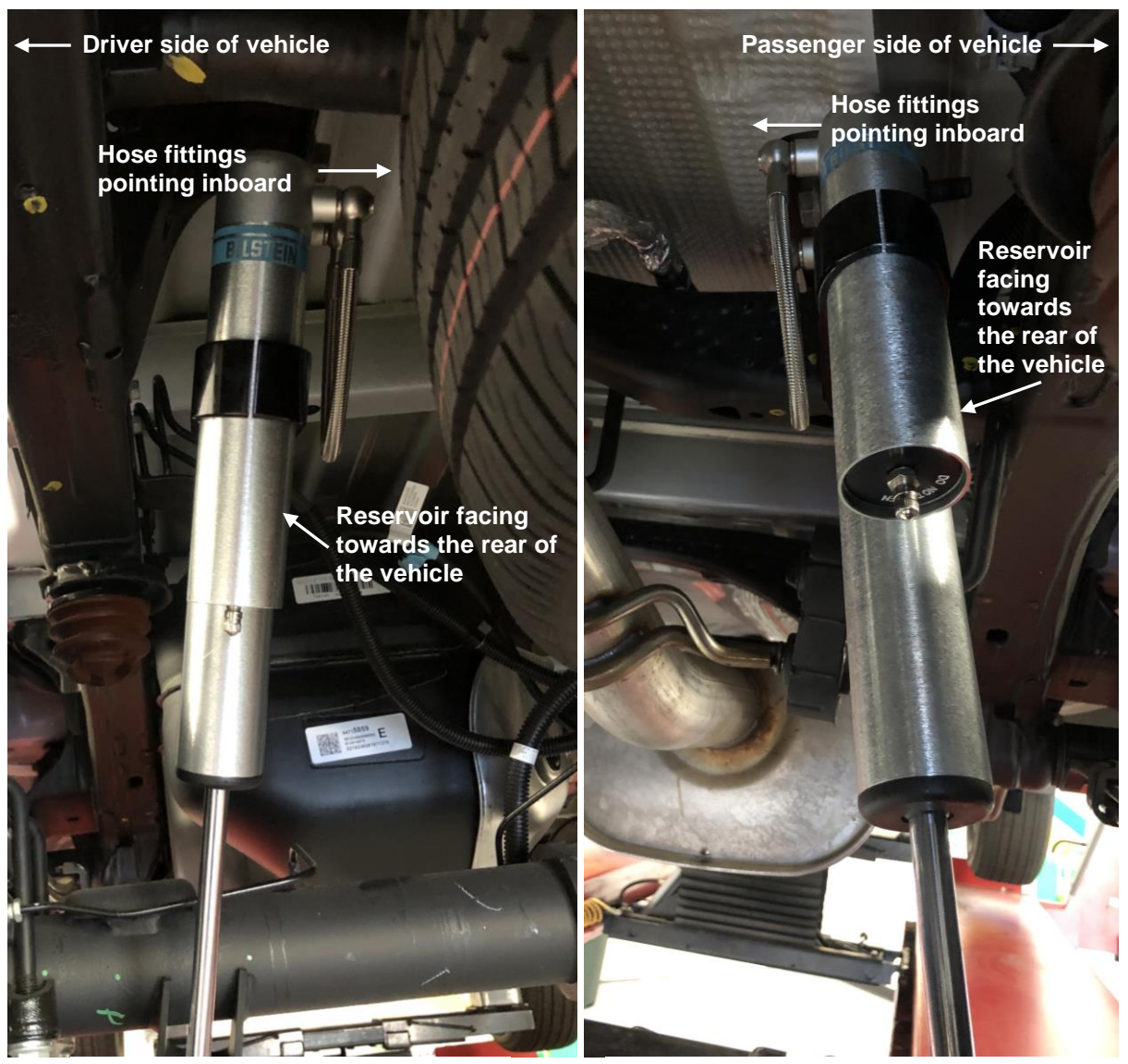
Figure 5. Driver Side (Rear View)