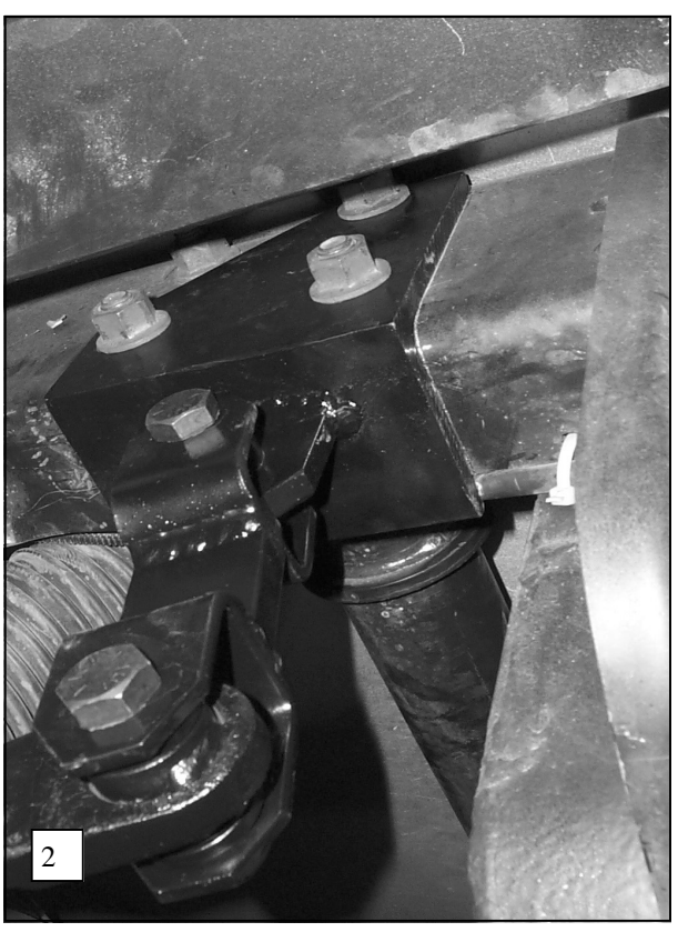
Torque Table IMPORTANT: Torque Axle U-Bolts To 275-300 ft. lbs.

3/8" = 35 ft. lbs. -7/16" = 45 ft. lbs. -1/2" = 75 ft. lbs. -9/16" = 90 ft. lbs. -5/8" = 120 ft. lbs.