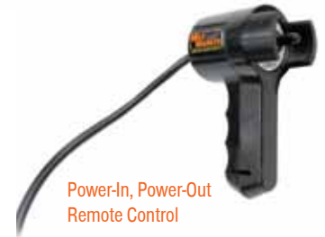
Power-In, Power-Out Remote Control