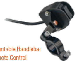
Mountable Handlebar Remote Control