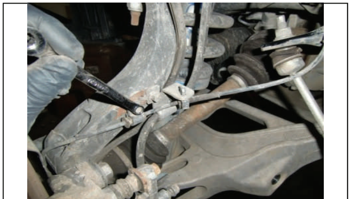
Reconnect ABS wiring, sway bar end link and outer tie rod