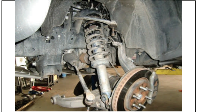
Support suspension and remove lower control arm bolts