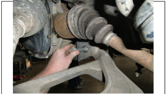
Raise LCA into frame and reattach with OE bolts