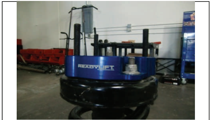
.Install spacer on top of strut using OE hardware