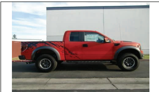
Reinstall wheels/tires lower to ground, test drive, align